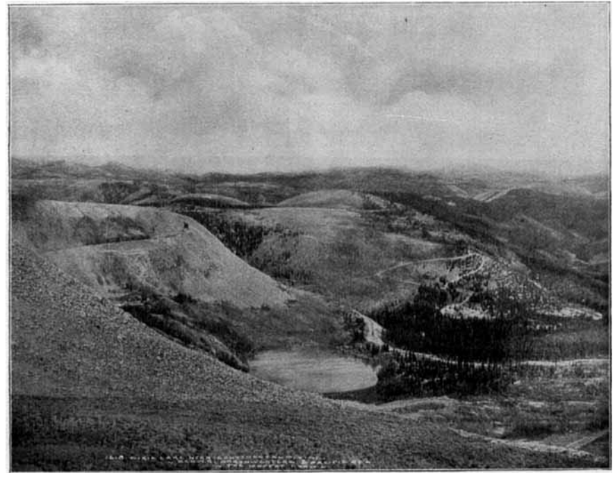
DIXIE LAKE. One mile beyond Yankee Doodle Lake, and 160 feet higher.

Hotel Toovey, 3 East Twentieth avenue, 6 rooms, 75 cents to $1.00.