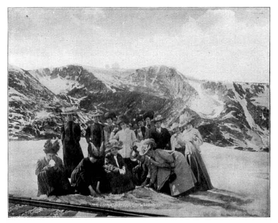
Snowballs in August. On the top of the world, 60 miles from Denver.